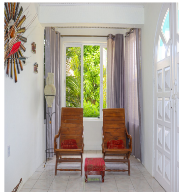
SEE PROPERTY ON GOOGLE MAPS