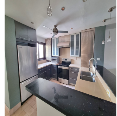
SEE PROPERTY ON GOOGLE MAPS