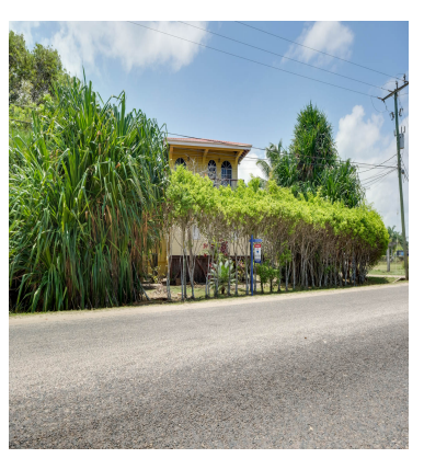
SEE PROPERTY ON GOOGLE MAPS