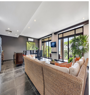
SEE PROPERTY ON GOOGLE MAPS