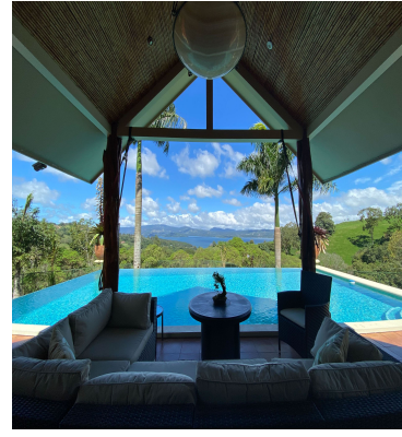
SEE PROPERTY ON GOOGLE MAPS